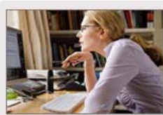
Kelly Richards makes $217 every day working part-time from home on her computer. Othas are even reporting earning as much as $500+ per day from their computers.